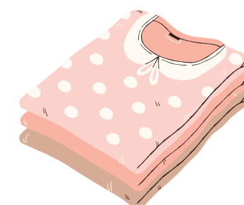
extra clothing including socks

Reminder to parents and families.... taking photos or video footage on or around our school playground and property during school hours is strictly prohibited.