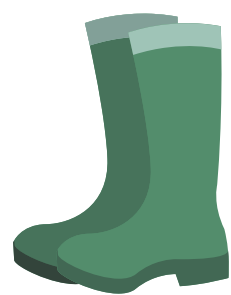
rain or waterproof snow boots