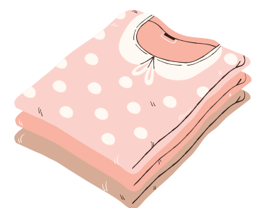
extra clothing including socks

Students who carry an Epi Pen and/or Puffer last year can pick up a copy of the new form for 2024/2025 at the school office. Please fill out both sides of the form and attach an original prescription label. Parents can go to their pharmacy to ask for an extra label.